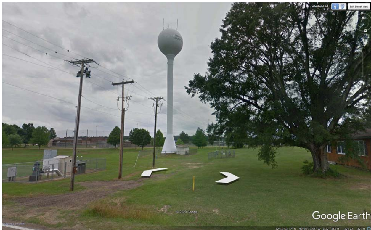
View of North Tank from HW 468